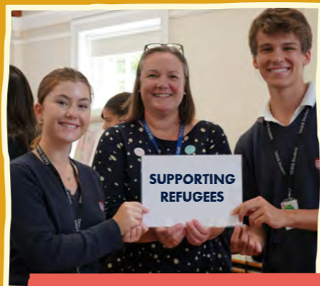
STUDENTS AT TASIS

Revive childhood memories with classic games like egg and spoon,