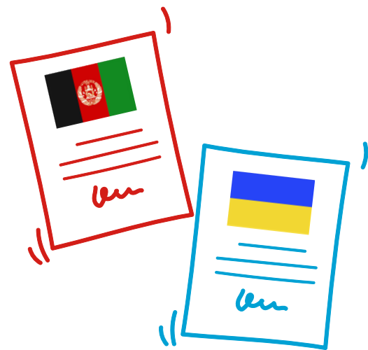
Table 1 on the following page gives an overview of the different family reunion entitlements and mechanisms for people with protection status, Afghans resettled under the ACRS, and Ukrainians in the UK under the Homes for Ukraine scheme and the Ukraine Family Scheme.

This demonstrates the pitfalls of piecemeal policy-making, with a focus on bespoke routes that confer different immigration statuses over a flexible and durable resettlement scheme that confers refugee status and all the essential rights that flow from that protection status.